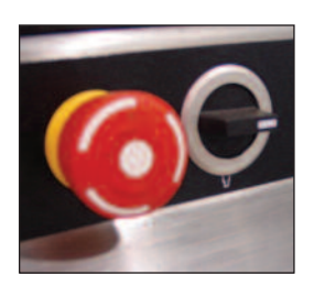
Easy-to-read control panel with emergency stop button.